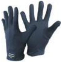
Full Finger FIR Gloves